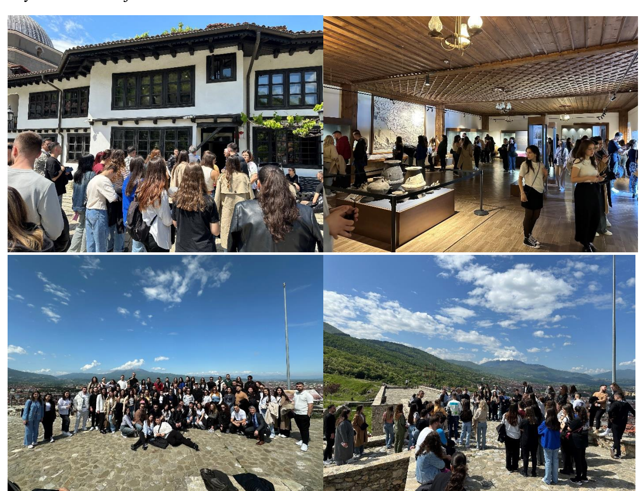
Figure 4. Photos developed during the third day of the conference - social activity in Prizren

The third day of the conference was dedicated to visiting the city of Prizren, and exploring the historical and cultural heritage of the city. First, the Castle of Prizren was visited, where the participants of the conference had the opportunity to see the wonderful panoramic view of the old city and the "Lidhja e Prizrenit" museum.