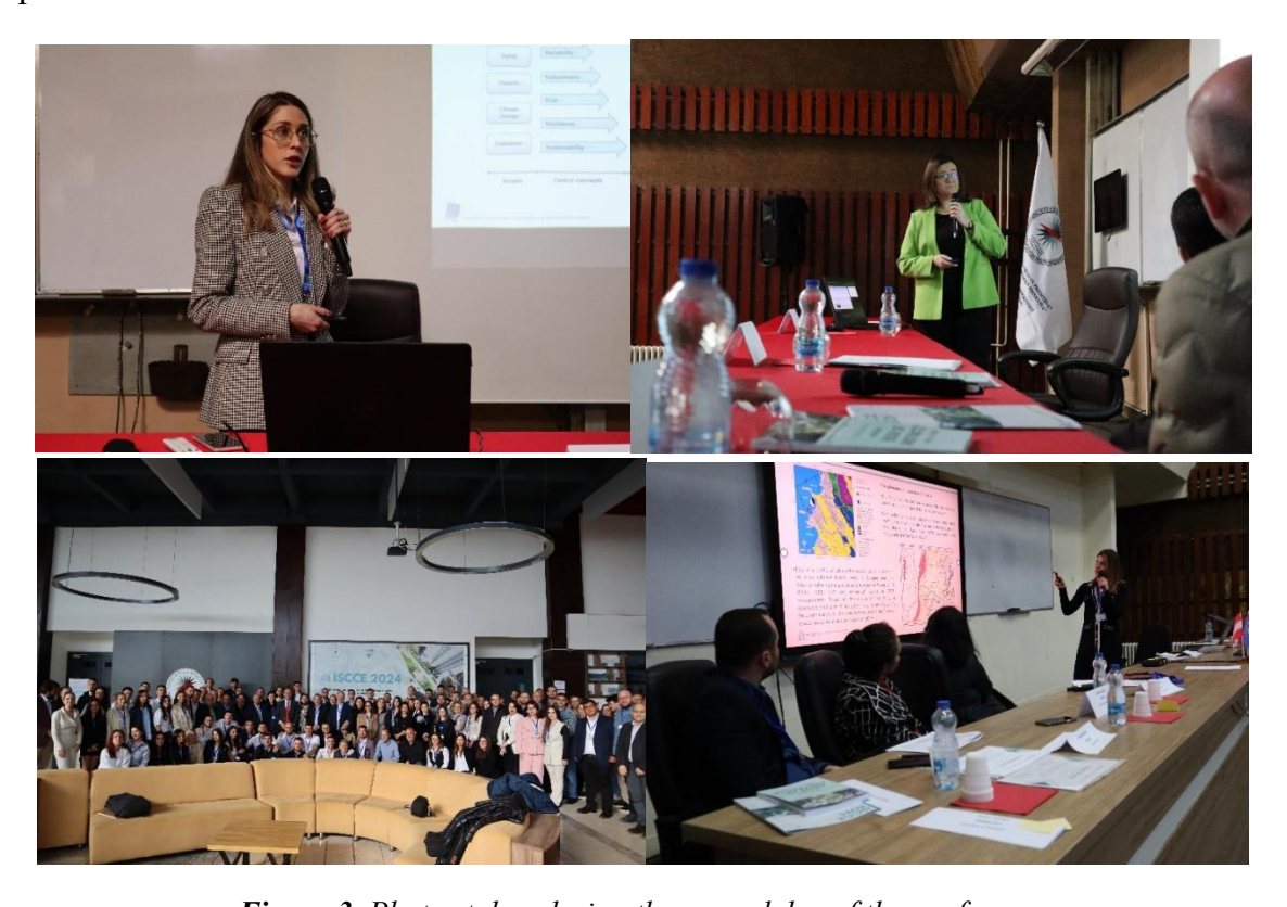
Figure 3. Photos taken during the second day of the conference

After the end of the sessions, the closing ceremony of the ISCCE 2024 conference took place, with speeches by the two host deans of the conference as well as the head of the conference secretariat. During the closing, gratitude was again expressed to the presenters, moderators, sponsors and all the participants and collaborators who contributed to the success of this conference, and especially the contribution of the students, support staff and the organizing committee was highlighted. The conference ended with the invitation and call for participation in the next edition of the conference to be held in Tirana. The second day of the student conference ended with the student party in the Amphitheater of Gërmia.