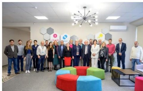
GEOBIZ Progress meeting participants, UPSC, Chisinau