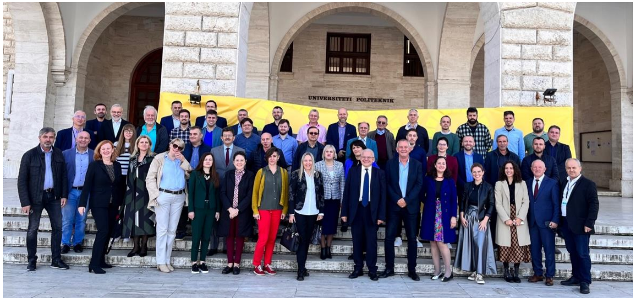
Participants of the GEOBIZ Final conference

Summarizing events in Tirana, it is to express our gratitude to the organizers, colleagues from Polytechnic University of Tirana and University of Tirana, which also took care, beside organization of events, to prepare excellent social events to the great satisfaction of all participants.