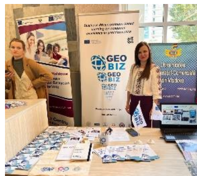
GEOBIZ at the Exhibition of Erasmus+ projects

On October 12, 2022, the National Erasmus+ Office in Moldova organized 35 Years of Erasmus+ Alumni Meet-up; the event was dedicated to the celebration of 35 years of the Erasmus+ Programme of the European Union and it was an open event for all interested.