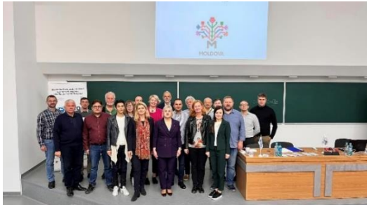
GEOBIZ Progress meeting participants, TUM, Chisinau

The main discussions were focused on results, quality assurance and improvements in higher education based on experience exchange between countries/partners that were involved in GEOBIZ Project. The first day was about the curriculum implementation at nine partner countries, quality assesment & evaluation and dissemination & exploitation.