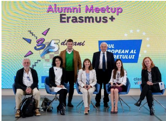
GEOBIZ project team at 35 Years of Erasmus+ Alumni Meet-up, Chisinau, October 12, 2022